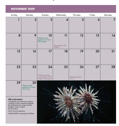
To view the Synthesis Calendar click here.

Nov 24 150 years since the publication of Darwin's The Origin of Species